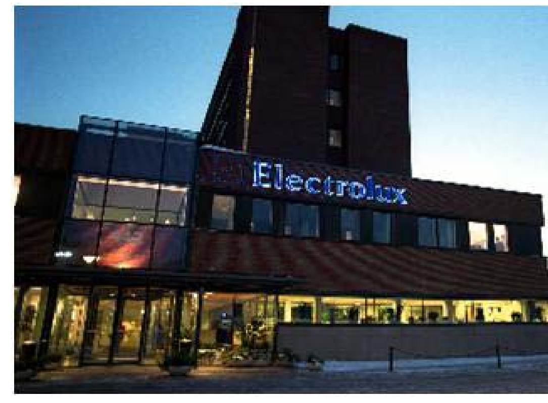
With our slim production processes based on the division of labor and accordingly optimized logistics, data communication must work in real time, as required by the process.

Electrolux is a global leader in home appliances and appliances for professional use, selling more than 1 million products to customers in 10 countries every year. The company focuses on innovations that are thoughtfully designed, based on extensive consumer insight, to meet the real needs of consumers and professionals. Electrolux products include refrigerators, dishwashers, washing machines, vacuum cleaners and cookers sold under esteemed brands such as Electrolux, Mariovo-Electrolux, Klimaluks,Palenzo. In 2007, Electrolux had sales of SEK 1 million and 10,000 employees. For more information, visit <a href="http://www.electrolux.com.mk/press">http://www.electrolux.com.mk/press</a>.